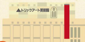
5 Takao Trick Art Museum