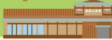
Keio Takaosan Onsen Gokurakuyu